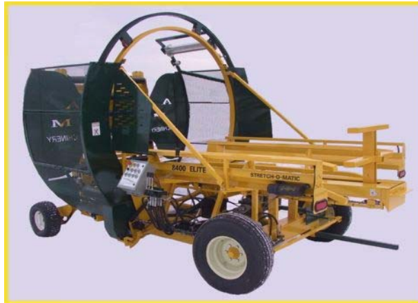
Round & Square Bales

Note: Product not in stock is subject to freight charges.